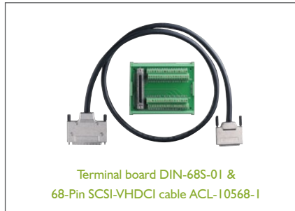
Terminal board DIN-68S-01 & 68-Pin SCSI-VHDCI cable ACL-10568-1

* For more information on mating cables, please refer to P2-59/60.